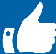
Ease of Use