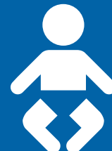
Safe to Use

Because every baby deserves the highest standard of care