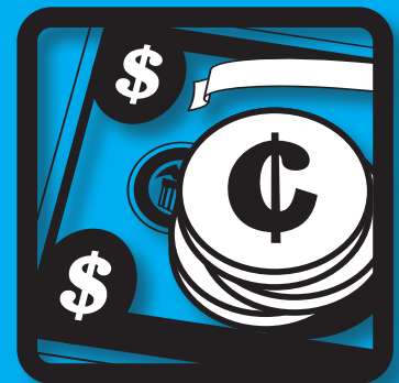
Total Cost of Ownership

Introducing the Lullaby LED phototherapy system with cutting-edge LED technology. It's just what you would expect from a system that builds on the Lullaby legacy. Because every baby deserves the highest standard of care.