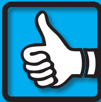
Ease of Use