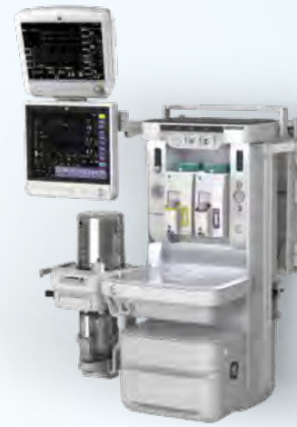
Wall mount system option (Carestation 650c)