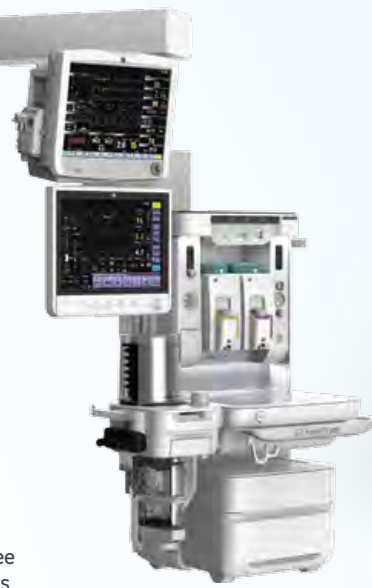
Pendant system option (Carestation 650c)