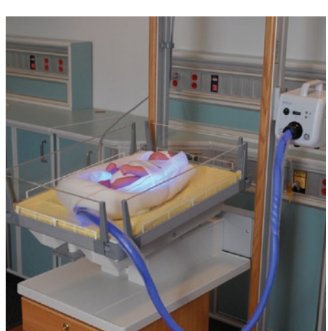
BiliSoft's whisper-quiet operation helps you maintain a quiet environment to promote sleep and growth.