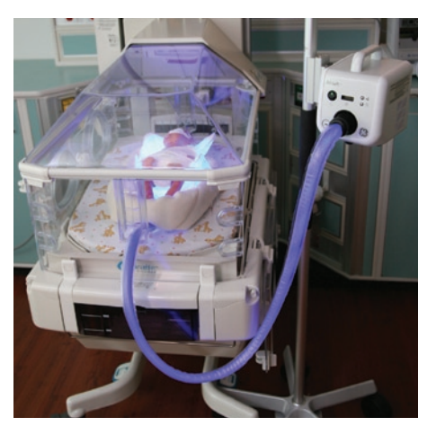
BiliSoft is an excellent solution for infants in the Neonatal ICU, where fast, effective treatment can be most critical.